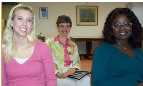
Students and professors at Brock University participated in the event.

NRIG hosted a Workshop on "How to Create Great Presentations and Create Excellent Posters".